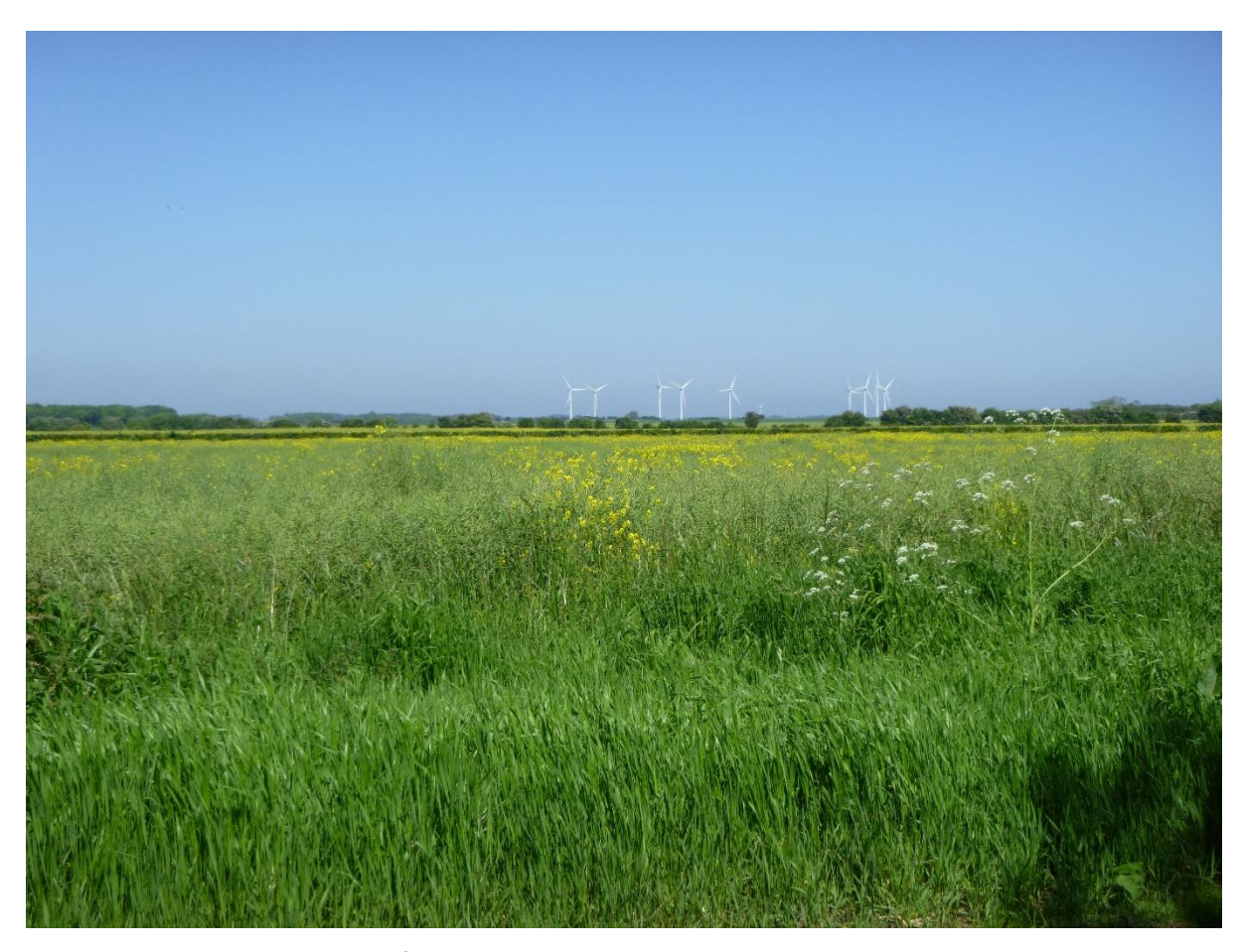
Wind Turbines across the fields

• Street Scene and General Environs – Respondents were generally very happy with the overall appearance of the village and were keen to maintain the rural atmosphere and enjoy the peace and quiet for which they moved here. Several people suggested placing seats on Humbleton Green to allow an opportunity to rest whilst enjoying the view – perhaps with the addition of planting boxes to enhance the scene. The provision of dog waste bins was also suggested as a way of ensuring that the environment of the village was maintained for the use of all residents. In the past, a Village Walk had compensated for the unusual lack of parish public footpaths but this facility had been withdrawn several years ago by the land owners. It was suggested that an approach be made to ascertain whether this, or a suitable alternative, could be made available to responsible walkers. It was felt possible that 'Right to Roam' legislation might enable this request to gain traction.