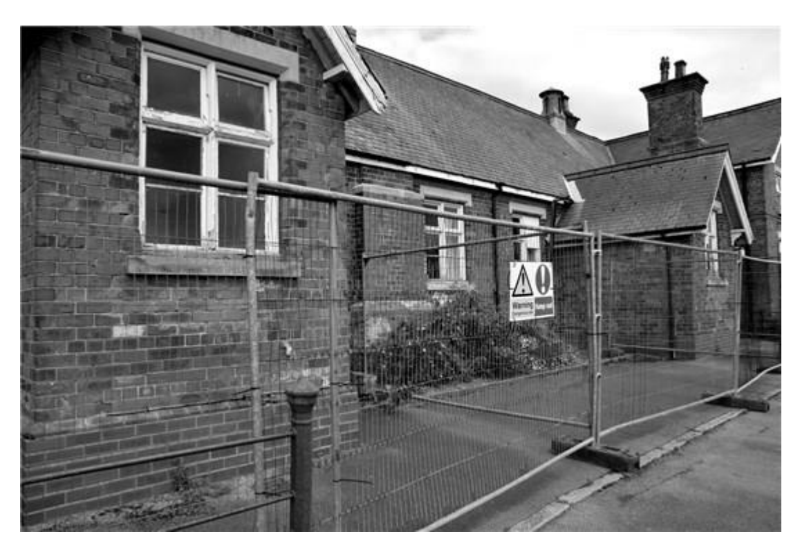
The Old School Building in disrepair

role of Community building for all events however, some work will need to be done to provide toilets and kitchen facilities. Funding would need to be sought for this from numerous sources, as well as approval from the Diocese of York for any proposed changes.