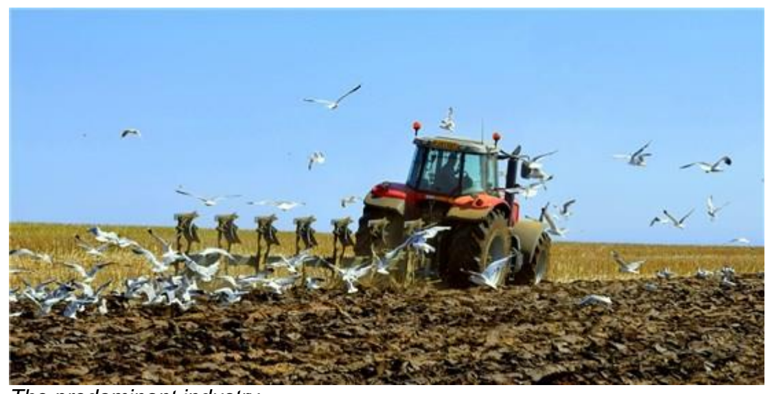
The predominant industry

In the 2011 census, there were 208 people living in the parish with 146 of those of working age (16-64). Approx 37 were aged 0-15 with 25 people aged over 65. The total area of the parish is 1,164.7 hectares.