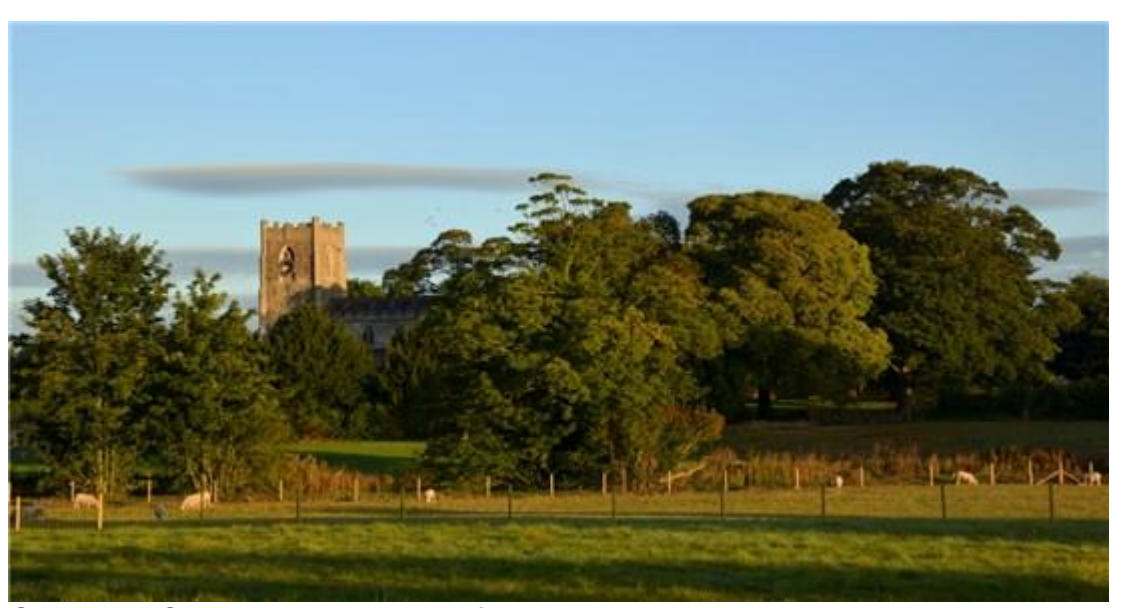
St Peter's Church across village fields

Approximately 4,000 communities across England have already been involved in developing Community Led Plans since the late 1970s. These have allowed communities to take responsibility for making things happen locally, rather than waiting on others to do it for them.