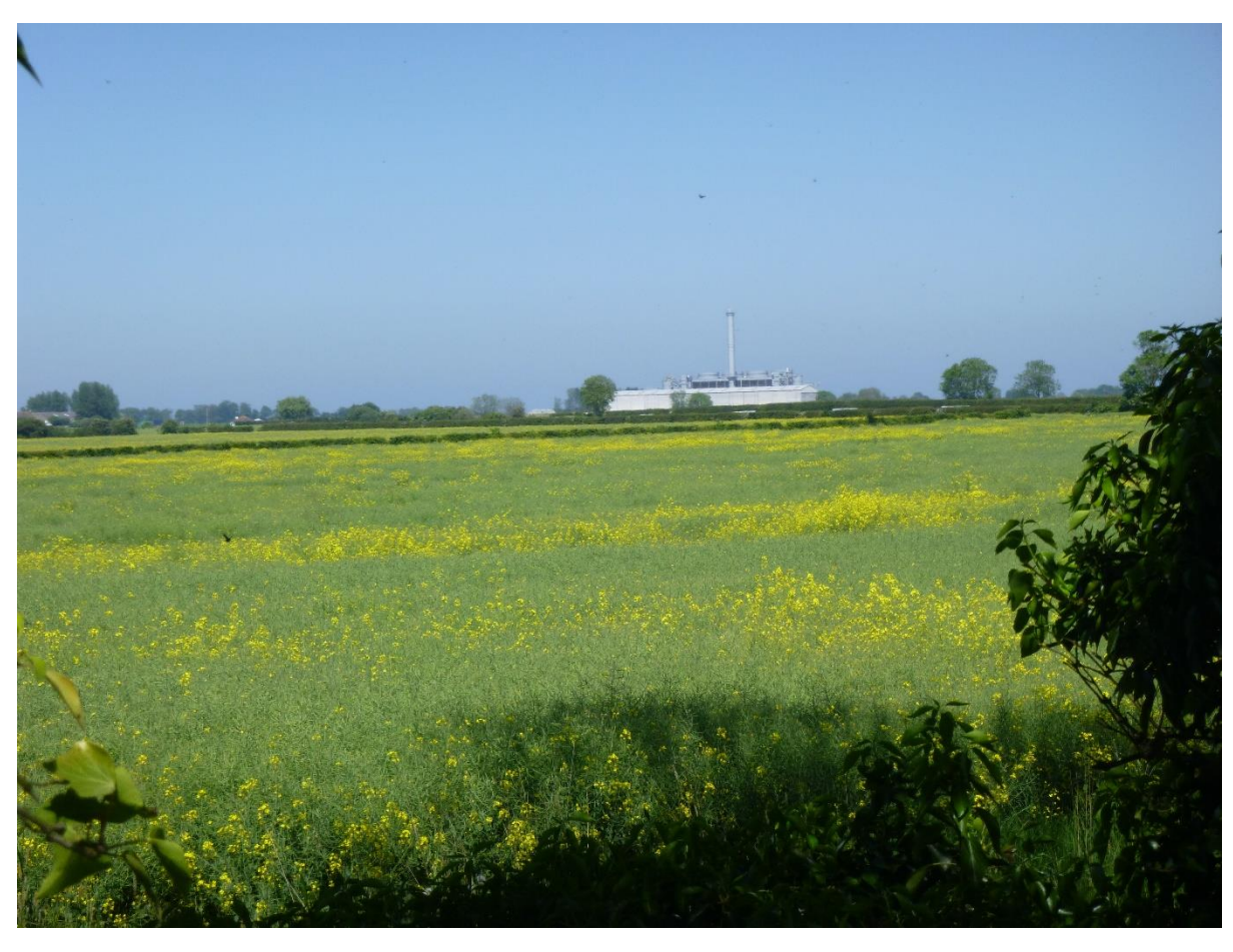
The Biomass Power Plant

• Planning Applications – It was felt that any new housing permitted should aim to balance 'affordable' dwellings with the more expensive developments given relatively low income levels for younger residents – a mix of rental and owner-occupier properties was generally felt to be most appropriate for the future. Again, on-road parking is a concern as was the lack of public transport and facilities. Aside from housing applications, there was an acceptance that the village could not attempt to 'stand still' and that some additional non-housing applications would be reasonable, although many felt that there are now more than enough wind turbines in our area which can be seen in almost every direction.