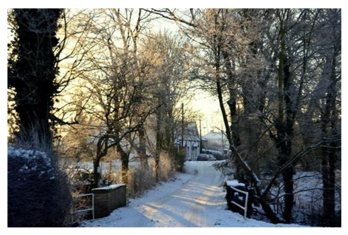
Winter view into Humbleton from the church