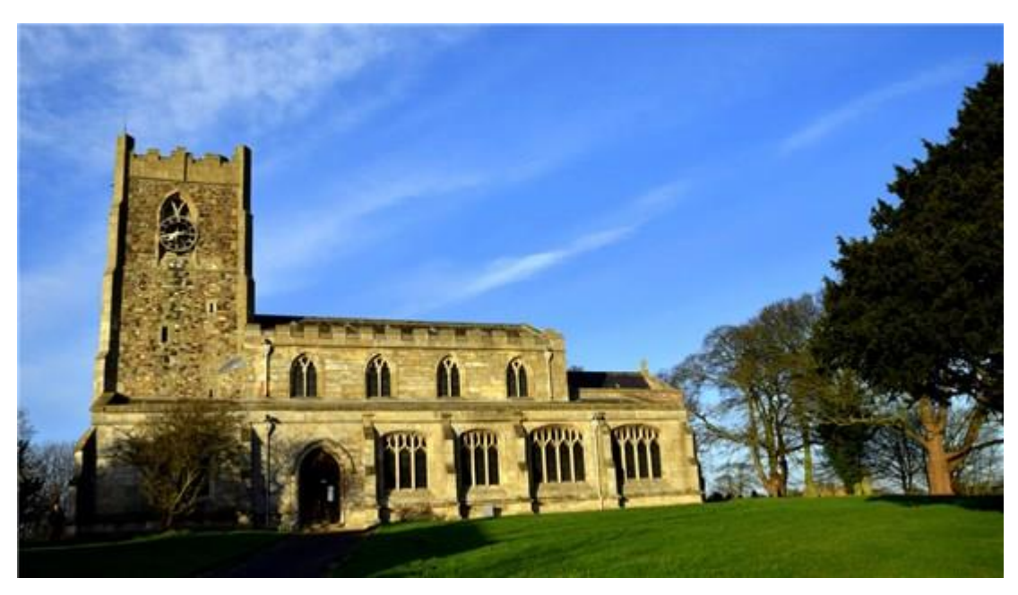
St Peter's Church