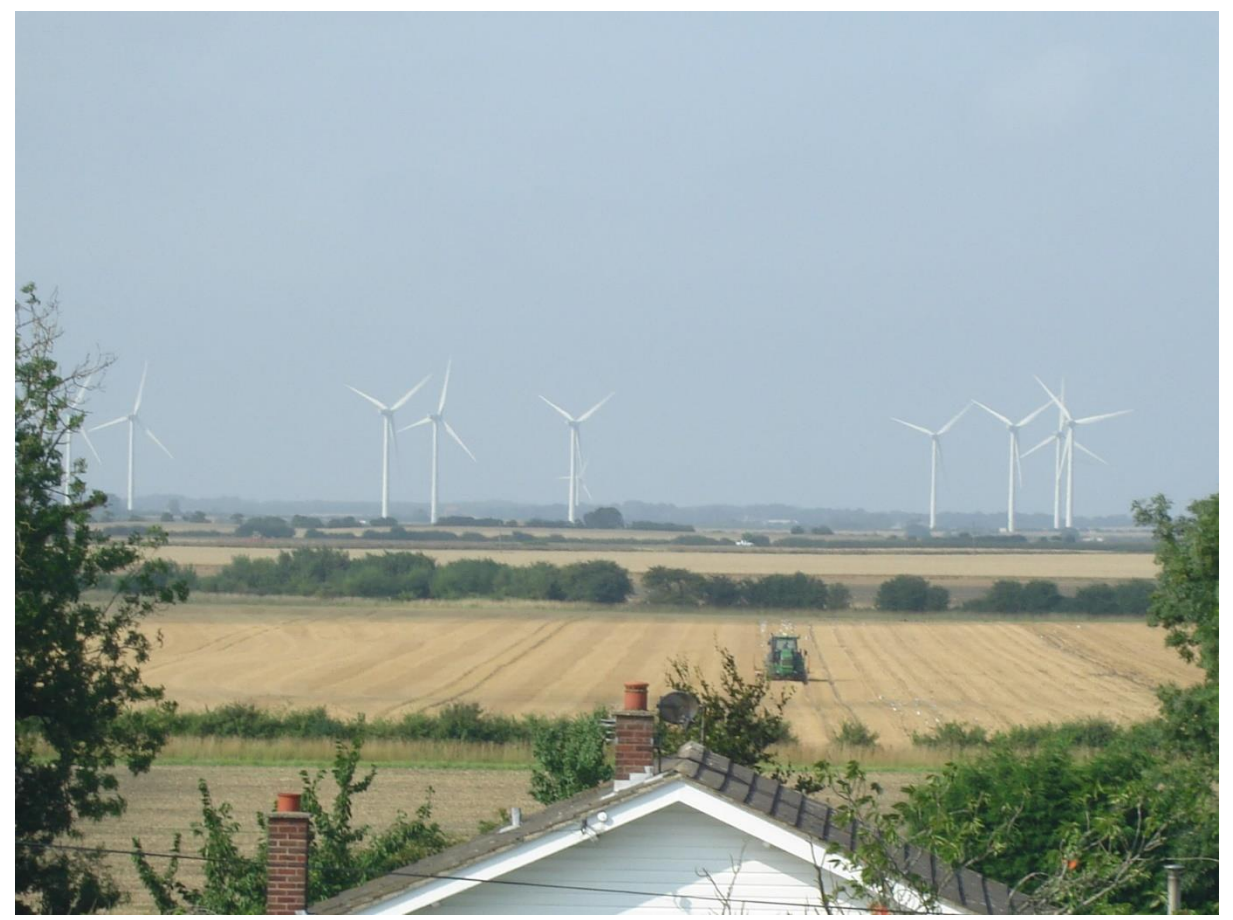
Green in every sense

"Community-Led Planning (also known as Parish Planning) is a tried and tested process already completed by over 4000 parishes and communities nationwide. In our region this has given a voice to over 200 communities, who have used their plans to encourage community spirit and action and also help with funding bids." Rural Action Yorkshire