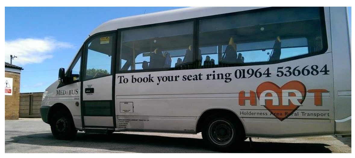
Community Transport Option

2022 Update. There are no longer any buses to/from Flinton or Humbleton. The closest bus stops are in Sproatley and Aldbrough – both over an hour's walk away.