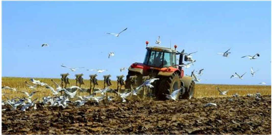
The predominant industry

In the 2011 census, there were 208 people living in the parish with 146 of those of working age (16-64). Approx 37 were aged 0-15 with 25 people aged over 65. The total area of the parish is 1,164.7 hectares. The early results of the 2021 census show a 2.4% increase across the East Riding.