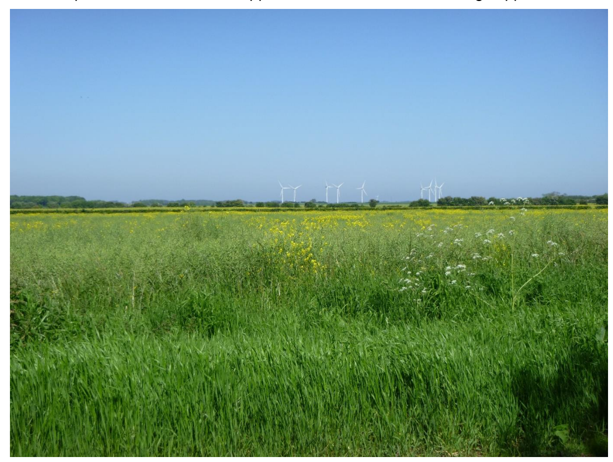
Wind Turbines across the fields

2022 Update. The new properties being built by the Heron Educational Foundation are all classed as 'affordable' (ie 80% of market rate). This was felt to be in-keeping with the residents' views expressed above and the application received overwhelming support.