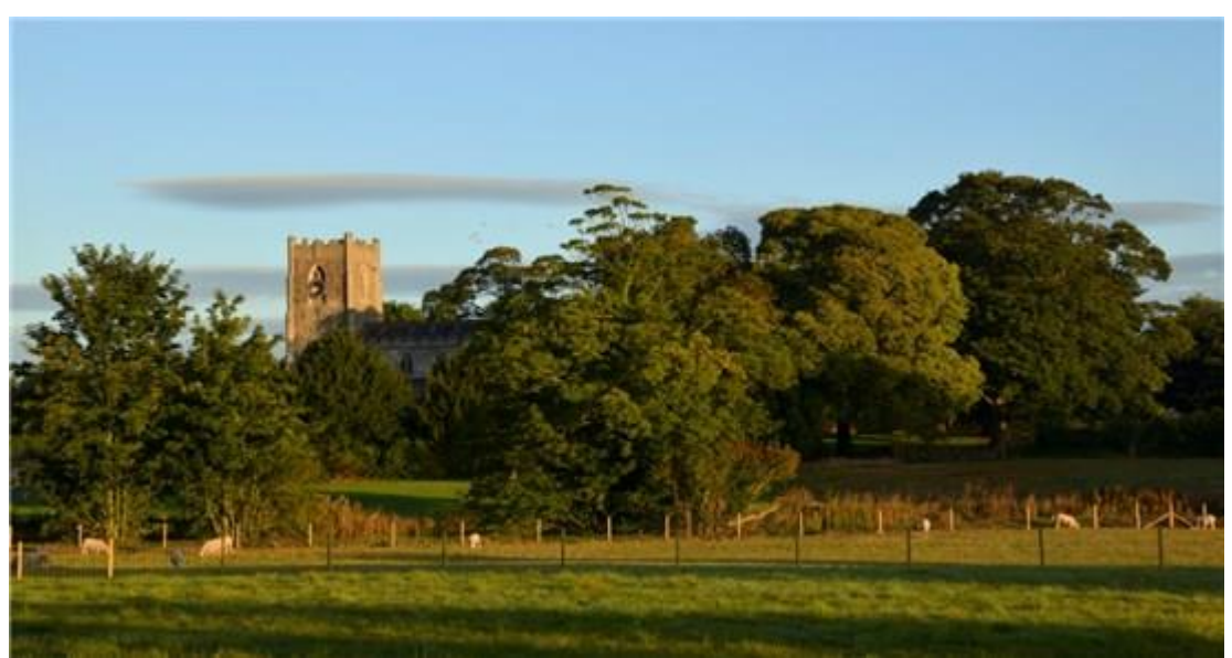
St Peter's Church across village fields

Approximately 4,000 communities across England have already been involved in developing Community Led Plans since the late 1970s. These have allowed communities to take responsibility for making things happen locally, rather than waiting on others to do it for them.